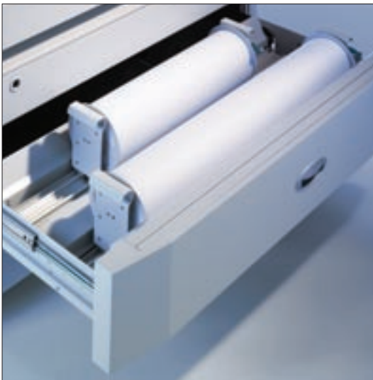
◀ ERGOTEC 2-roll-drawer: By request, we supply a 3rd and 4th roll for the models RS 6000 and RCS 6000 – or retro-fit them.